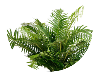
Silver Lady Fern