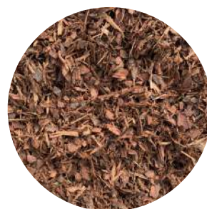
Brown pine mulch