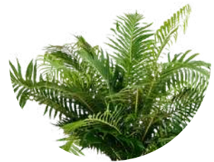
Silver Lady Fern