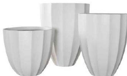
TOORAK SCALLOPED VASE