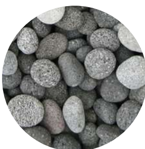
Charcoal lava stone