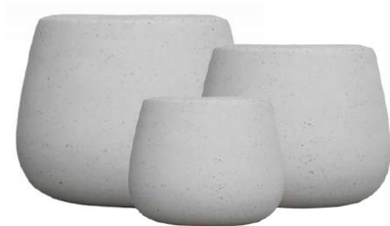
COPENHAGEN BELLY CUP