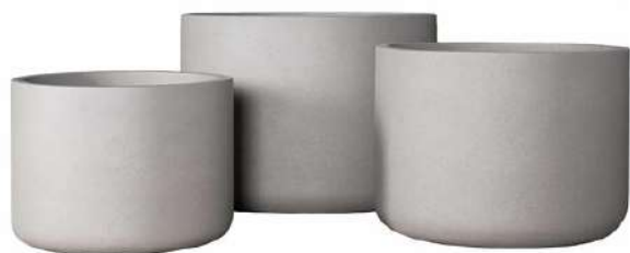
BRIGHTON LOW CYLINDER