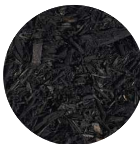
Black pine mulch