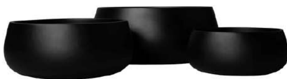
ELWOOD DUFFEL BOWL